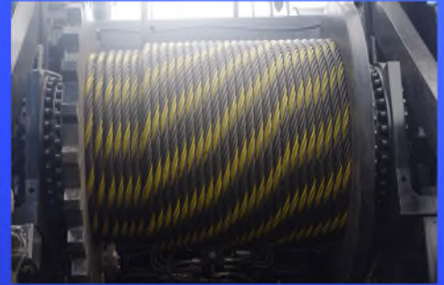
Newest Generation Comer Industries Driven Drums