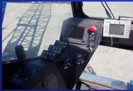
Ergonomic Cab with Fingertip Control