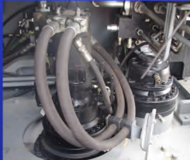
Hydraulic Hoist, Swing and Boom