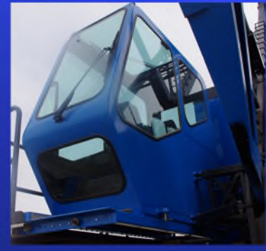
Increased Operator Visibility

The Lampson 4100 Millennium Crawler Crane combines the structural integrity and versatility of the Manitowoc 4100 with the safety and ease of operation of the new generation hydraulic operating system cranes. The modernized power train consists of an eco-friendly Tier 3/4i Cummins Engine driving state-of-the-art Comer drum planetaries, which increase single drum line pulls by up to 70% with two line size choices - 1 1/8" and 1 1/4" diameter. The swing system has been converted to hydraulic operation and the original hydraulic boom hoist drive has been retained. Operating controls have been modernized with computer enhanced electronic joysticks controlling all operating functions of the crane. The control system allows tandem drum operating abilities for situations requiring endless reeving. All Millennium series cranes are equipped with LSI load monitoring systems to further enhance safe lift operations.