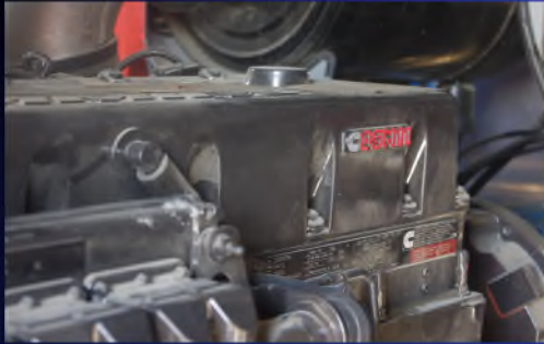
Cummins QSM Tier 3 /4i Engines meet Strict Emission Standards

Max. Capacity - Series 2 - 230 US Tons Max. Line Pull Main Drum - 55,000 lbs Max. Line Pull Aux. Drum - 55,000 lbs Maximum erected Main Boom Length - 260' Maximum erected Main Boom and Jib Length - 230' Boom 60' Jib Max. Spooling Capacity Main Drum - 2200' of 1-1/8" OR 1800' of 1 1/4" Max. Spooling Capacity Aux. Drum - 2200' of 1-1/8" OR 1800' of 1 1/4" Ability to accept Manitowoc Ringer® and Tower® attachments with no Modifications Tandem Drum Operation for endless reeving Meets FedOSHA requirements for Man Basket Suspension - No Freefall Capability